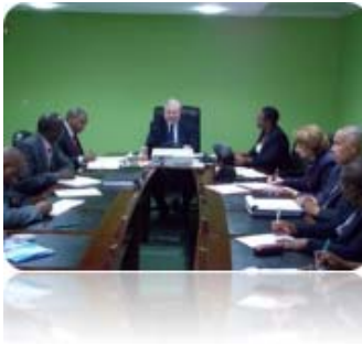
(Peer Evaluators at the opening meeting of the KENAS Pre-Peer Evaluation)