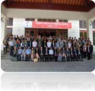
(APLAC General Assembly, Da Nang, Vietnam - September 2013)